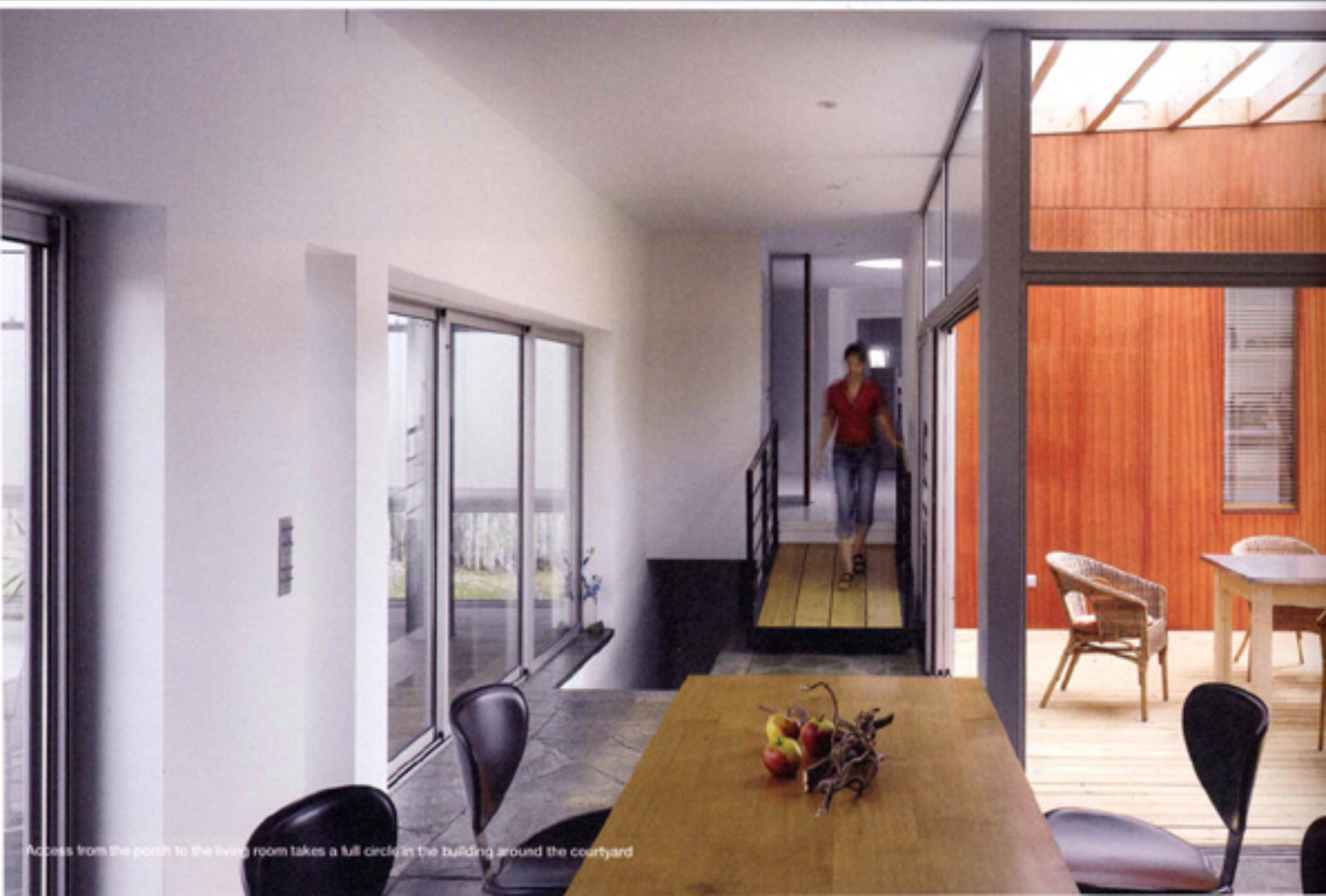
Access from the porch to the dining room takes a full circle in the building around the courtyard