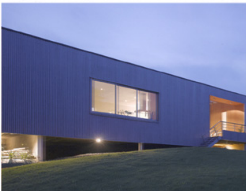
Light view of the facade

현대적이면서도 자연 친화적인 환경을 동시에 누릴 수 있는 평화로운 분위기의 생활 공간을 제안했다. 실내수영장을 구비하며 방 4개와 거실 1개로 구성된 주택으로 아름다운 전망을 향해 탁 트인 전망을 갖는다. 실내수영장 또한 태양광을 온종일 누릴 수 있게 고려했다. 현관으로부터 거실까지의 진입 동선은 내부 뜰을 둘러싸고 있는 건물을 한 바퀴 둘러오게 했다. 날변지형의 급속으로 이루어진 외벽은 주변의 농업 건축물에서 영감을 얻었으며, 시간이 흘러 재료의 노후화를 통해 주위환경에 더욱 자연스럽게 스며들 것이다.