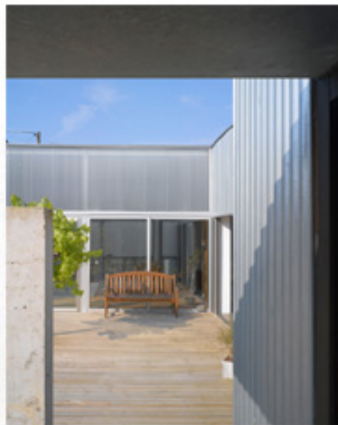
View from the entrance